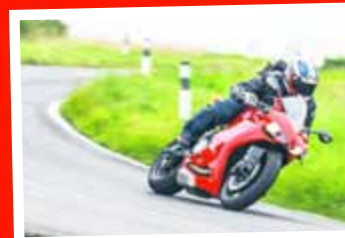
Carbon does have a place on the road

"They're durable, the finish doesn't tarnish, and I love how subtle they are. There's nothing to dislike but the price."