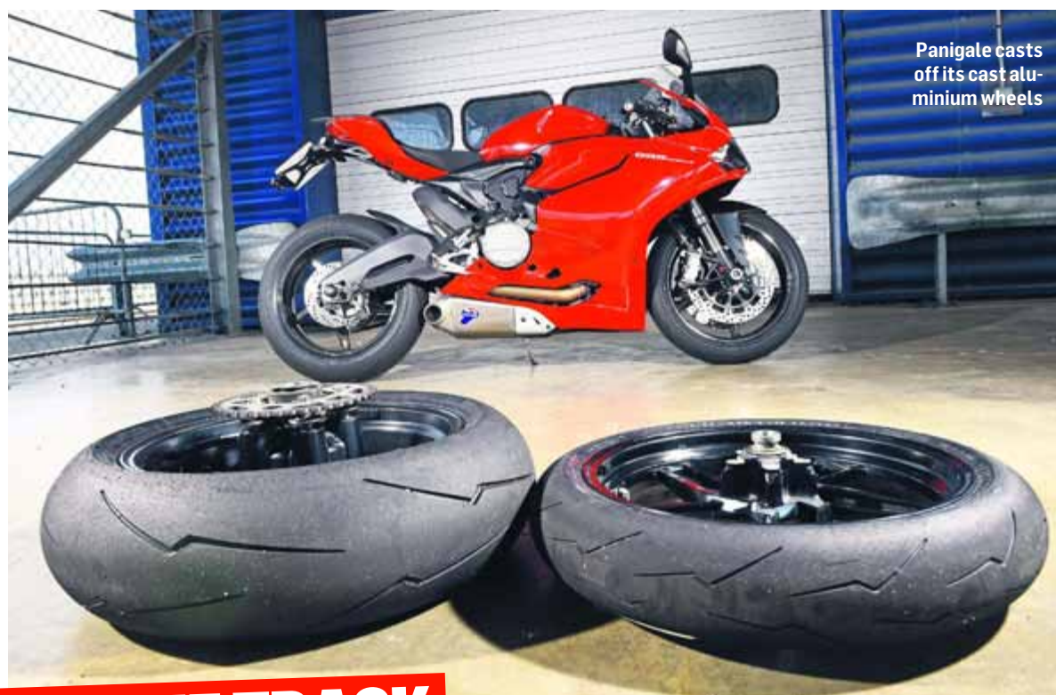
Panigale casts off its cast aluminium wheels

If you knew you could finish a race, or a track day session, six seconds ahead of your rival, you'd take that all day long. But lap times aside, the carbon wheels let you ride fast with less effort, which will be a blessing if, like most of us, you don't train everyday like a racer, especially at a physically-demanding track like Cadwell or Oulton Park MCN